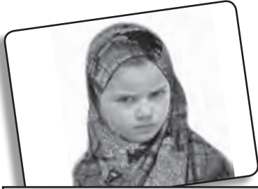
1. She is angry.